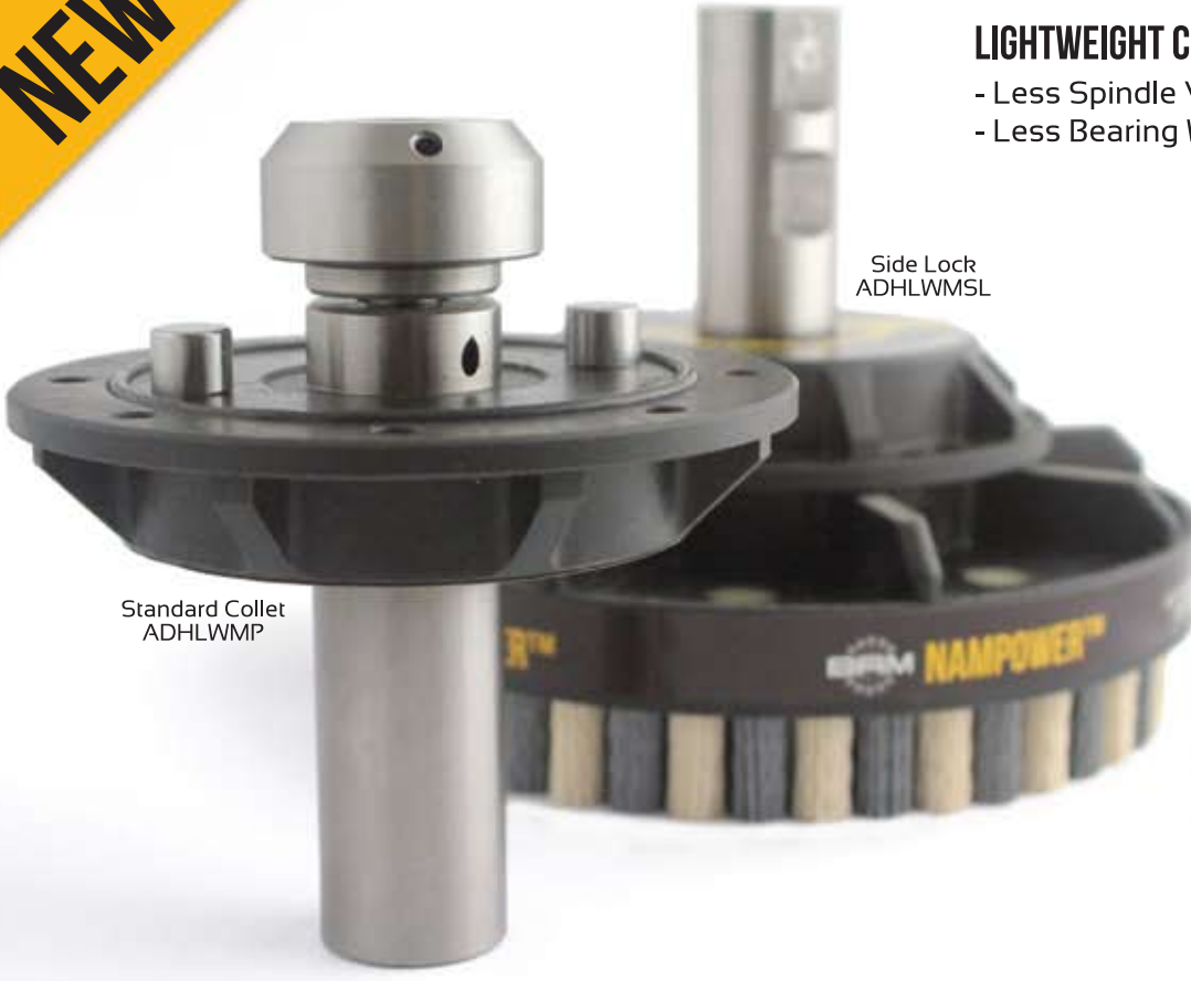
Standard Collet ADHLWMP